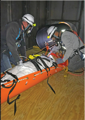
Patient Packing and Medical Evaluation are essential skills to an effective confined space rescue team.

Classroom training is invaluable, but to ensure true preparedness nothing can top hands on training. Unfortunately, making time for busy staff to travel to a facility can be impossible for many companies. That's why ISTS now offers this incredible mobile training experience!